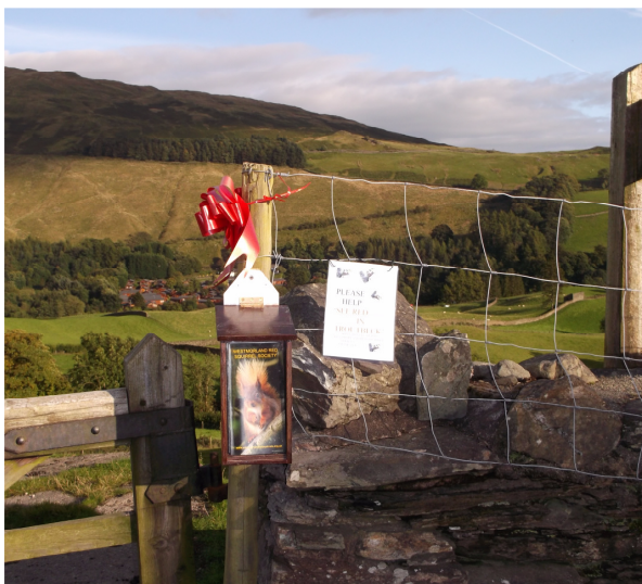
A Troutbeck collection/leaflet box in situ

Your co-operation is invaluable. . . . Thank you.