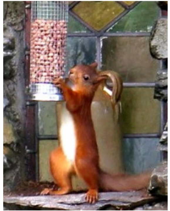
After an absence of 15 years red squirrels are returning to Windermere. This photograph was taken in summer 2013 at Windermere Common. (Bird feeders are a big attraction)

During the late spring and early summer of 2013 more intensive grey control took place in woodland adjacent to the busy Rayrigg Road and this quickly brought results. As can often happen, as soon as grey numbers are drastically reduced a lone red might venture into the area to take a look around. During the summer we received the first report of a red being spotted opposite the Steamboat Museum, very close to the centre of Bowness. We were delighted but obviously sceptical as a red hadn't been seen there for 15 years. Then came a second report followed quickly by a third from nearby residents who had spotted a red on their bird feeders. These Bowness gardens are close to Rayrigg Wood where grey control had been taking place so hopefully the new arrival(s) would have been able to take up residence although there have been no further reported sightings in that area to date.