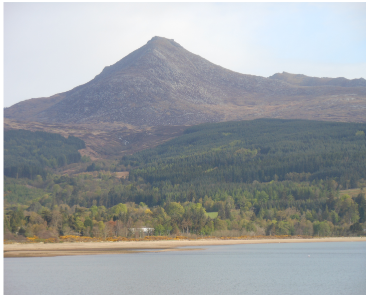
Goat Fell, Arran

Collaborative efforts with local FCS foresters on Arran have identified the need for permanent red squirrel core areas, particularly in the north and west of the island. These areas would offer red squirrels a refuge when surrounding plantations get harvested and re-planted during the course of future forest operations. These areas would also serve as source areas from which red squirrels can colonise new woodland when it becomes available. Ongoing work this year will examine forest design plans, and, in collaboration with FCS, attempt to ensure that the red squirrel population, which will drop in the short term as a result of forest restructuring, will recover to previous or even higher levels and that red squirrels have a long term future on Arran.