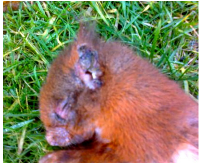
Red with SQPV found near Brockhole

Whilst greys remain unaffected by the virus an infected red will quickly become lethargic and develop painful skin ulcers and lesions on paws, mouth and eyes and eventually go blind. Death comes within two weeks. Currently the only way to avoid the spread of this deadly virus is to remove greys and thus the source of the infection.