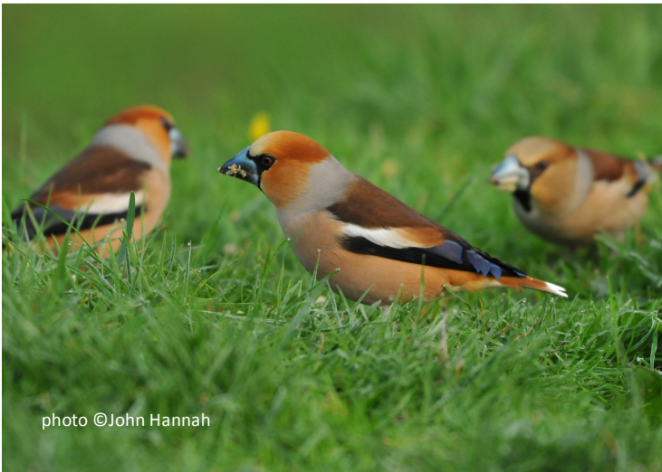
Hawfinches – 2 males, 1 female

National Trust's Sizergh Castle estate lies 5 miles to the south of Kendal. It is 1600 acres in size of which 700 acres are mixed deciduous woodland (mainly Ash, Beech, Larch and Oak). The last Red Squirrel(s) to be seen was in Brigsteer back in around 2002. Since then greys have increased in number/taken over and have become a nuisance in areas of woodland with the damage they can do. This is drastically noticeable in the Hornbeams at the main car park of the castle. This area is renowned for Hawfinch throughout the year with a winter group of up to 15 birds (mainly Nov – end of April) which are known to have bred locally. The greys do a lot of damage to the Hornbeam trees which are the Hawfinch's prime feeding trees (yew, beech and fruit trees also good). I am very protective of the birds and sick of seeing the squirrels eating their food!! Greys have also been proven to take young Hawfinch from the nest.