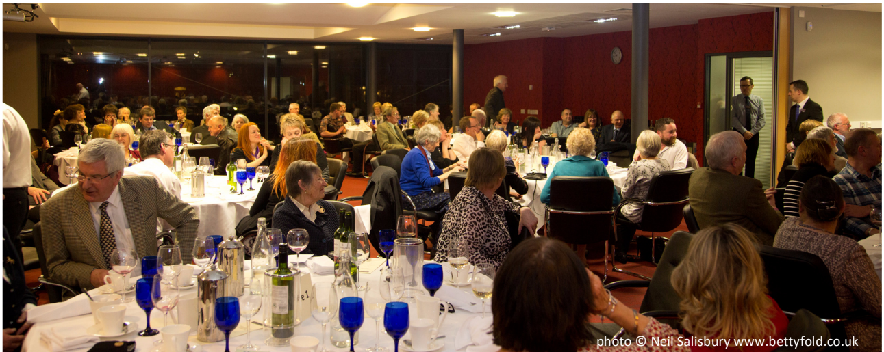
Guests await the raffle...