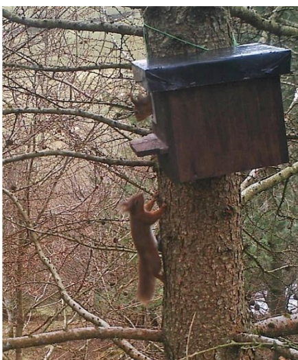
A wooden nestbox in use

I have been working on modifications of their designs and I would be delighted to receive comments from anyone about this or, indeed anything else that I have written here.