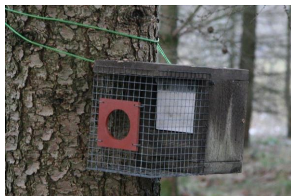
A wooden Red Squirrel only feeder