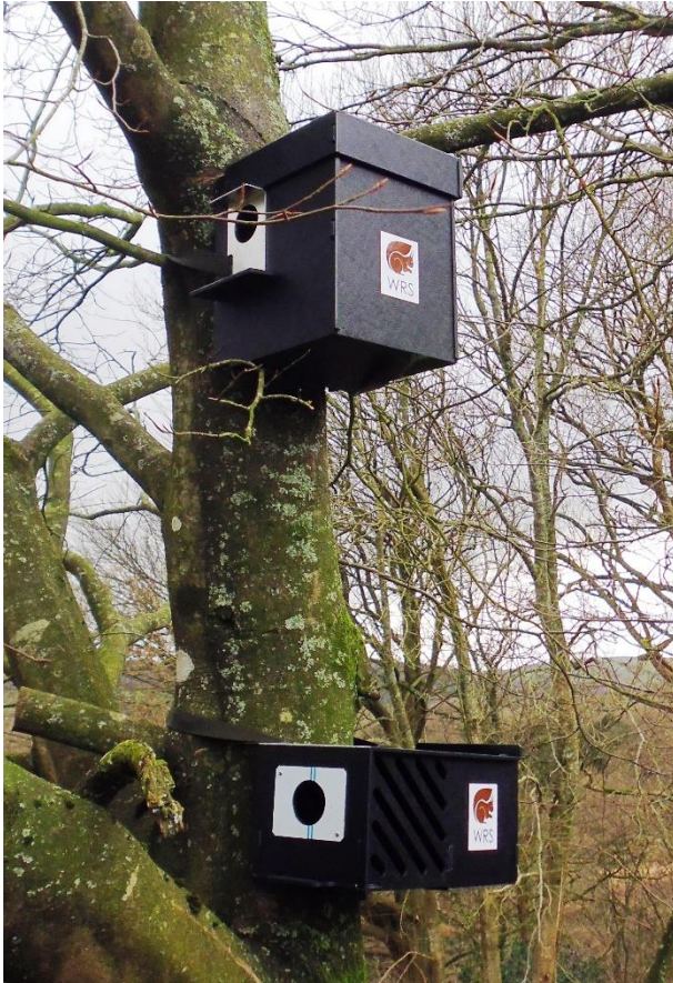
The New-Design Nestbox and Feeder in Polypropylene

I have now produced a design for the manufacture of the nestboxes and feeders in Polypropylene. This material is strong, lightweight and temperature resistant, making it an excellent modern replacement for wood.